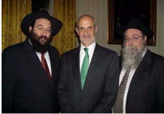
Secretary of Homeland Security Michael Chertoff ...